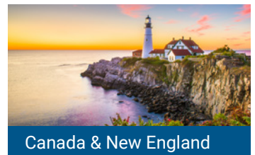
Canada & New England