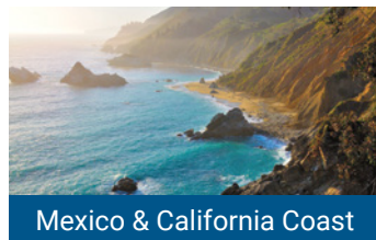
Mexico & California Coast