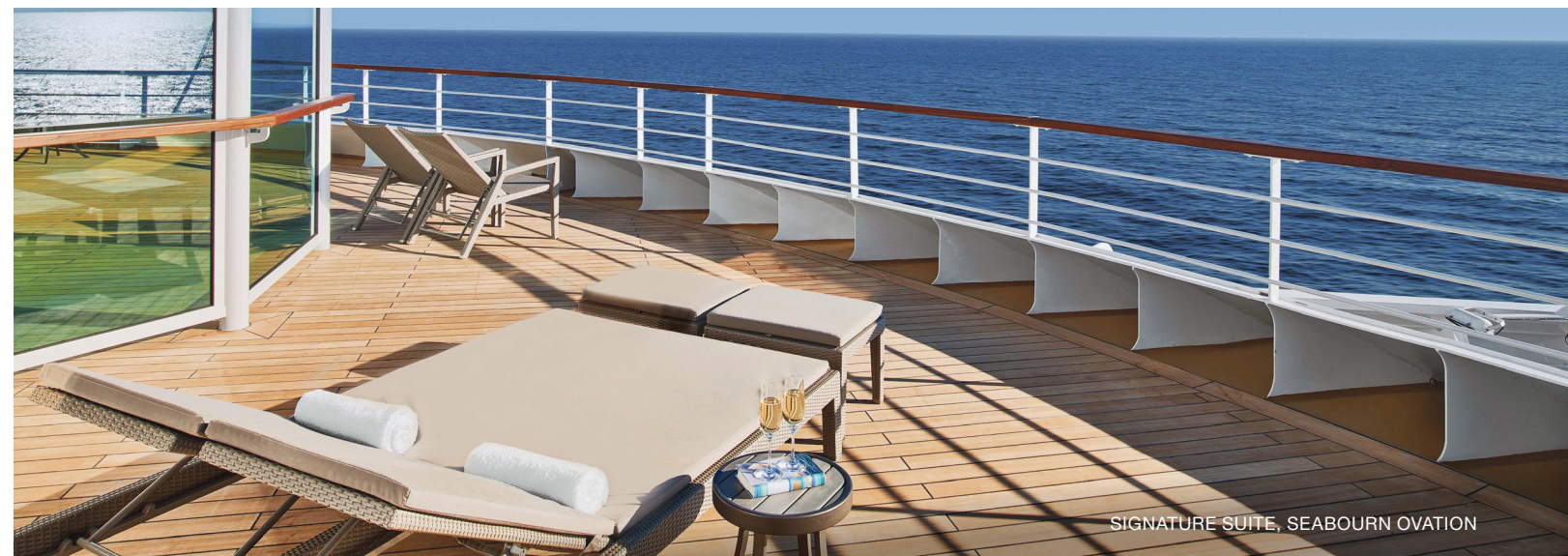
SIGNATURE SUITE, SEABOURN OVATION