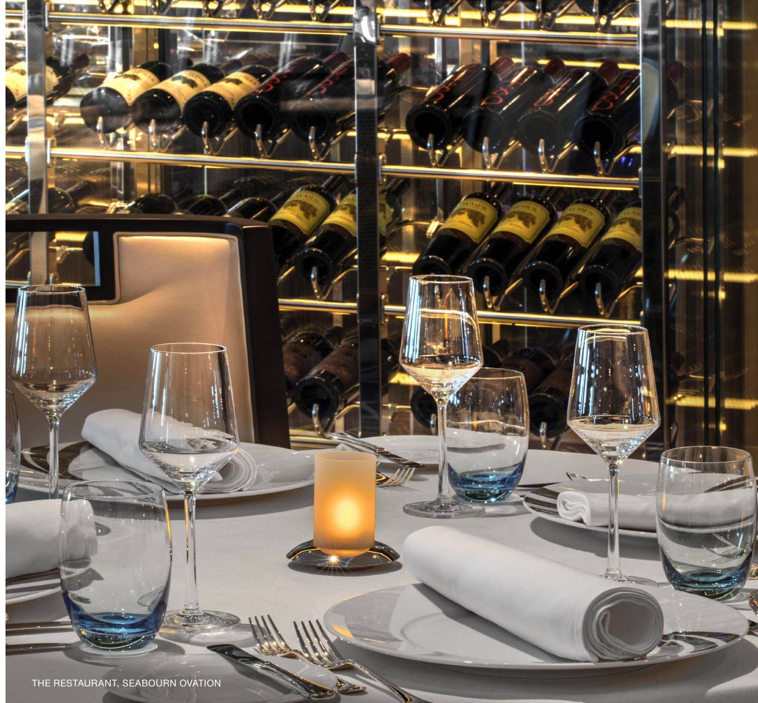
THE RESTAURANT, SEABOURN OVATION