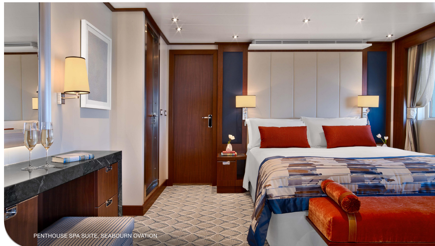
PENTHOUSE SPA SUITE, SEABOURN OVATION