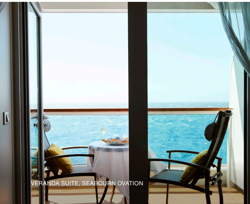
VERANDA SUITE, SEABOURN OVATION