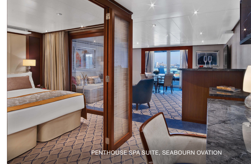
PENTHOUSE SPA SUITE, SEABOURN OVATION