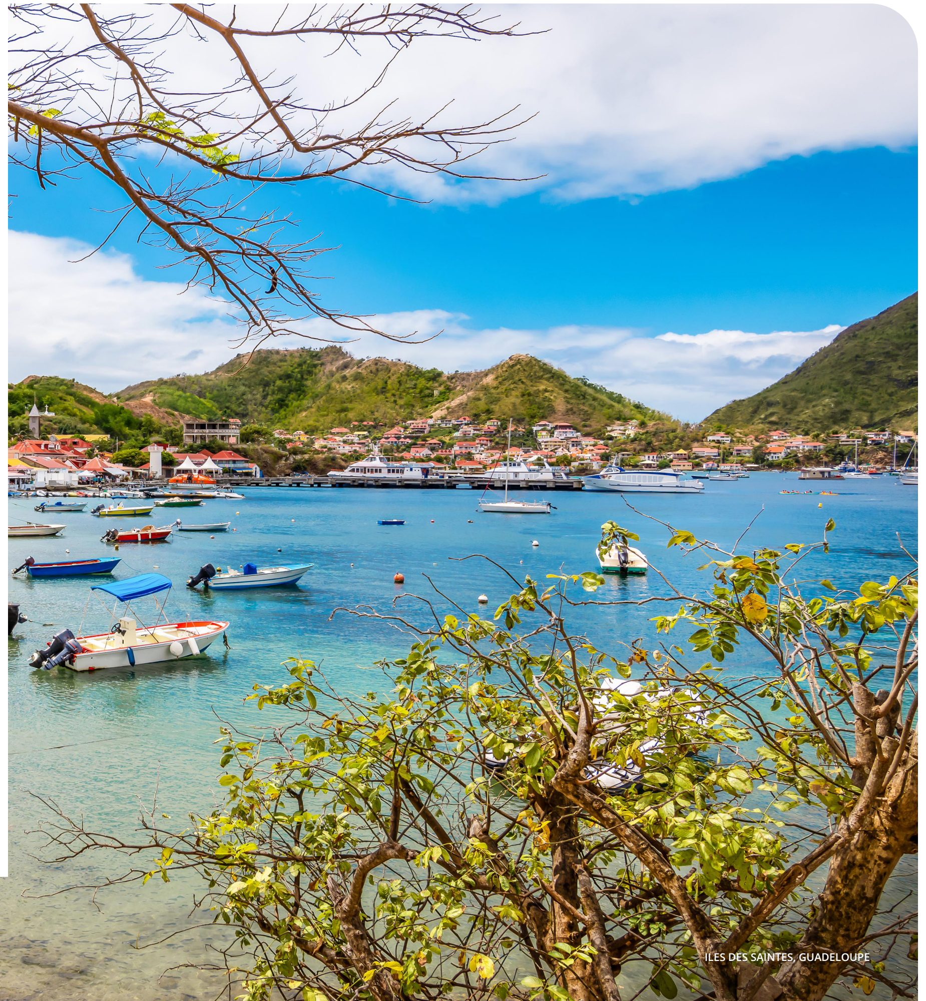
ÎLES DES SAINTES, GUADELOUPE

≈Marina Days and Caviar in the Surf ® are weather and conditions permitting.