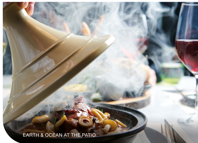
EARTH &amp; OCEAN AT THE PATIO