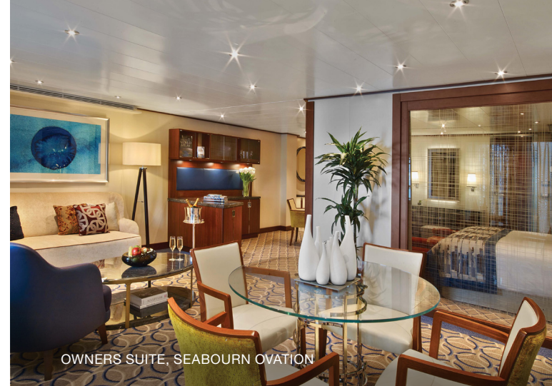
OWNERS SUITE, SEABOURN OVATION