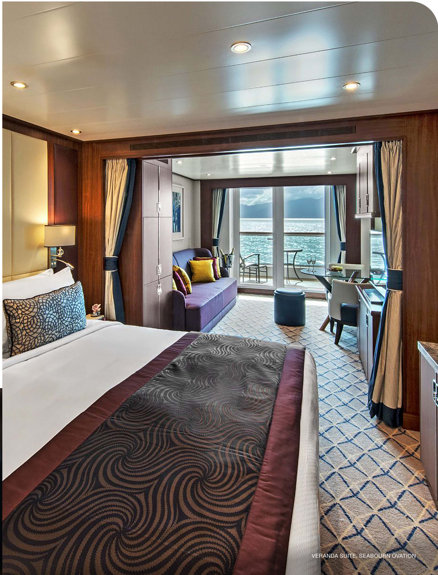
VERANDA SUITE, SEABOURN OVATION