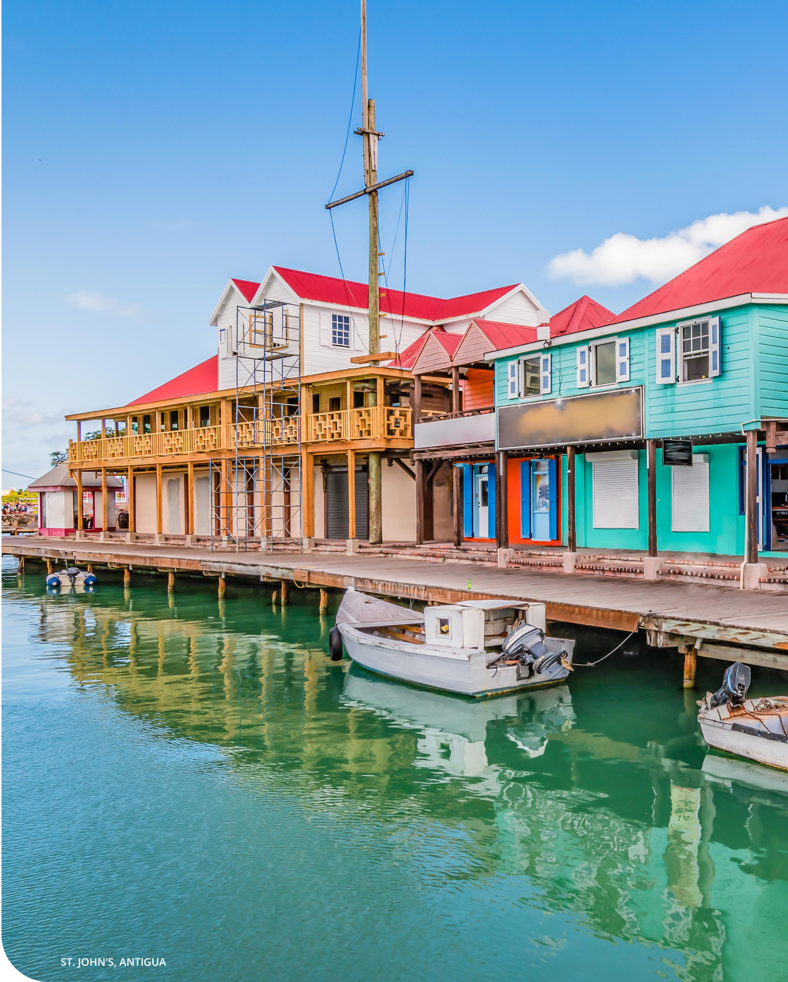
ST. JOHN'S, ANTIGUA